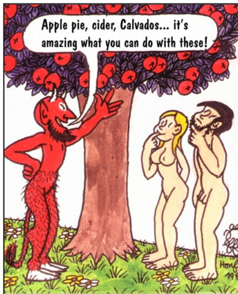
Cartoon from the series Création du Monde by French artist Jean Effel. The original is in the Eugène Boudin gallery, Honfleur, Normandy.