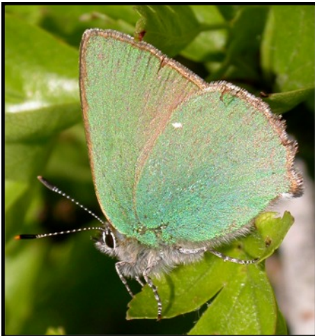
Green hairstreak, Bratton.