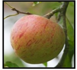
A Blenheim Orange apple

especially as we have already converted a substantial quantity of our churchwarden's Blenheim Orange apples into cider!