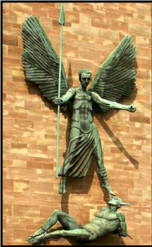
Epstein's St Michael on Coventry Cathedral

From early times, Michael's cult was strong in the British Isles. Churches at Malmesbury (Wiltshire) , Clive (Gloucestershire) and Stanmer (East Sussex) were dedicated to him. Bede mentions him. St Michael's Mount in Cornwall was believed to commemorate a vision there in the 8 th century. By the end of the Middle Ages, Michael had 686 English churches dedicated to him.