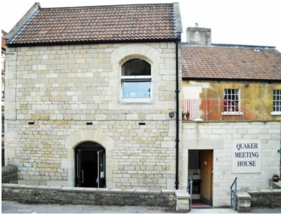
The Friends' Meeting House, Whiteheads Lane.