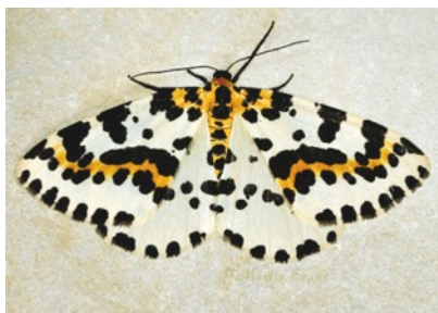
The Magpie moth

The recent rather unsettled weather has curtailed butterfly activity somewhat although in the warm sunny spells, some species are still active. Speckled Woods are now the commonest woodland species although some rather tattered Silver-washed Fritillaries are to be seen with occasional Commas and Red Admirals. Most Peacocks seem to have gone into early hibernation for the winter and Painted Ladies have remained scarce throughout the year. There have only been three reports of Clouded Yellow immigrants from the continent, one way back in May near Salisbury and two on 9th August in the north – one at Highworth and another in the Cotswold Water Park. Second generation Common Blues are now frequent on the grasslands, together with Chalkhill and Adonis Blues and Brown Argus in generally smaller numbers.