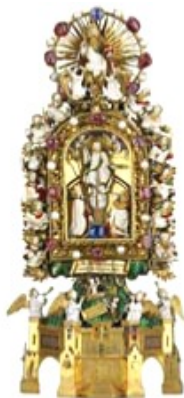
The Reliquary of the Holy Thorn, France, ca. 1390-97

they have been loaned, and which they have never left before. The Vatican itself has loaned two of its most precious and honoured ones from the Lateran Palace in Rome, one of which, from the Pope's private Chapel, contains an image of Christ, said to have been imprinted on a towel with which he wiped his face in the Garden of Gethsemane. The journey around the exhibits is itself a kind of pilgrimage, with excellently clear and helpful directions and explanations.