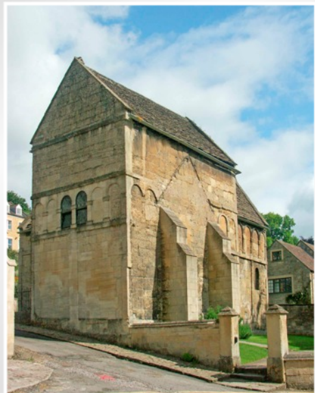
The Saxon church of St Laurence