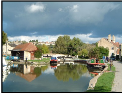
Bradford Wharf, Frome Road, on the K & A.