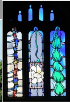
The Chapel of St Mary Tory Inset: East window by Mark Angus