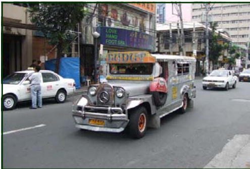
A jeepney in Manila

shopping mall of which Dody was very proud. We didn't want to stop! By this time, Manila was a complete traffic jam. Local transport is either by “Jeepney” ( elongated jeeps,