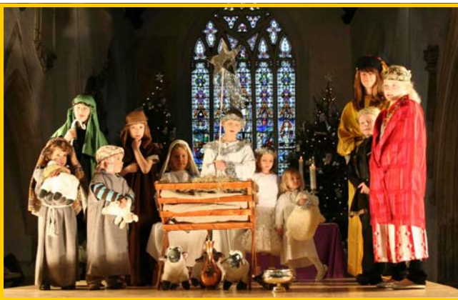
The Christmas tableau.

On January 10 th , we shall be attending the Trowbridge Pantomime,