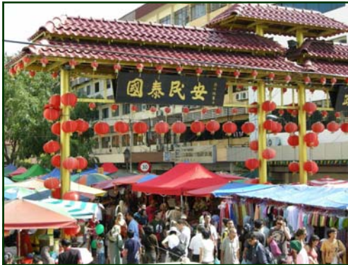
Kota Kinabalu market