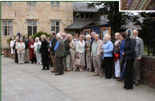
Waiting for the coach at Tewkesbury