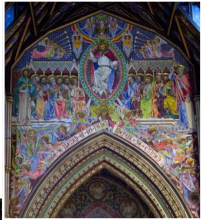
The Last Judgement: painting over the chancel arch at Holy Innocents, Highnam.