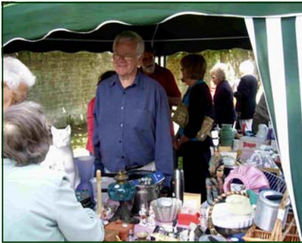
The bric-à-brac stall