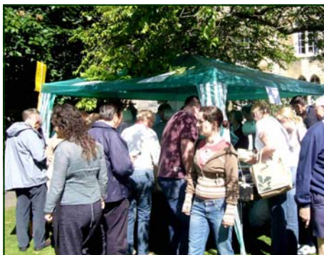
The book stall under siege