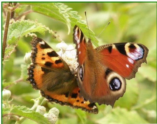
Small Tortoiseshell and Peacock - Blakehill