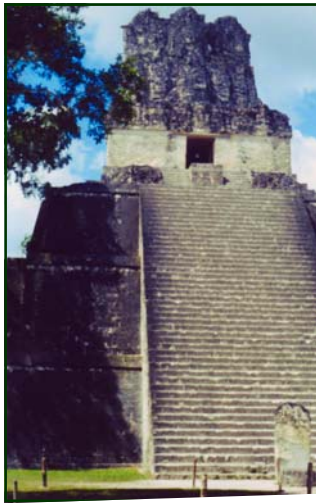
When completed it was used by the priests who must have toiled up and down in their opulent costumes. It is amazing that the Maya could raise such huge buildings without the use of the wheel or block & tackle.

Tikal began about 600 BC as shown in the discoveries of numerous artefacts and pottery that can be dated to that period.) A stone pyramidal structure with nine sloping terraces supports a platform which forms the base of a temple of three rooms. An ornamental roof comb tops the structure. The huge steps, referred to as the “construction stairway” were used to carry tons of masonry blocks, lime mortar and other building material.