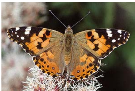
Painted Lady ( Vanessa cardui ).

A few other species are still around in late summer – the three 'whites', the Large, Small and Green-veined have a second and sometimes third generation in long, hot summers; the Holly Blue , which has been particularly common this year, and the Speckled Wood , which becomes commoner as the season progresses until late September. Depending on weather conditions, many will remain active throughout September and even October and early November. When garden flowers become scarce, ivy blossom becomes a great attraction for them as well as many other insects such as bees, wasps and hoverflies.